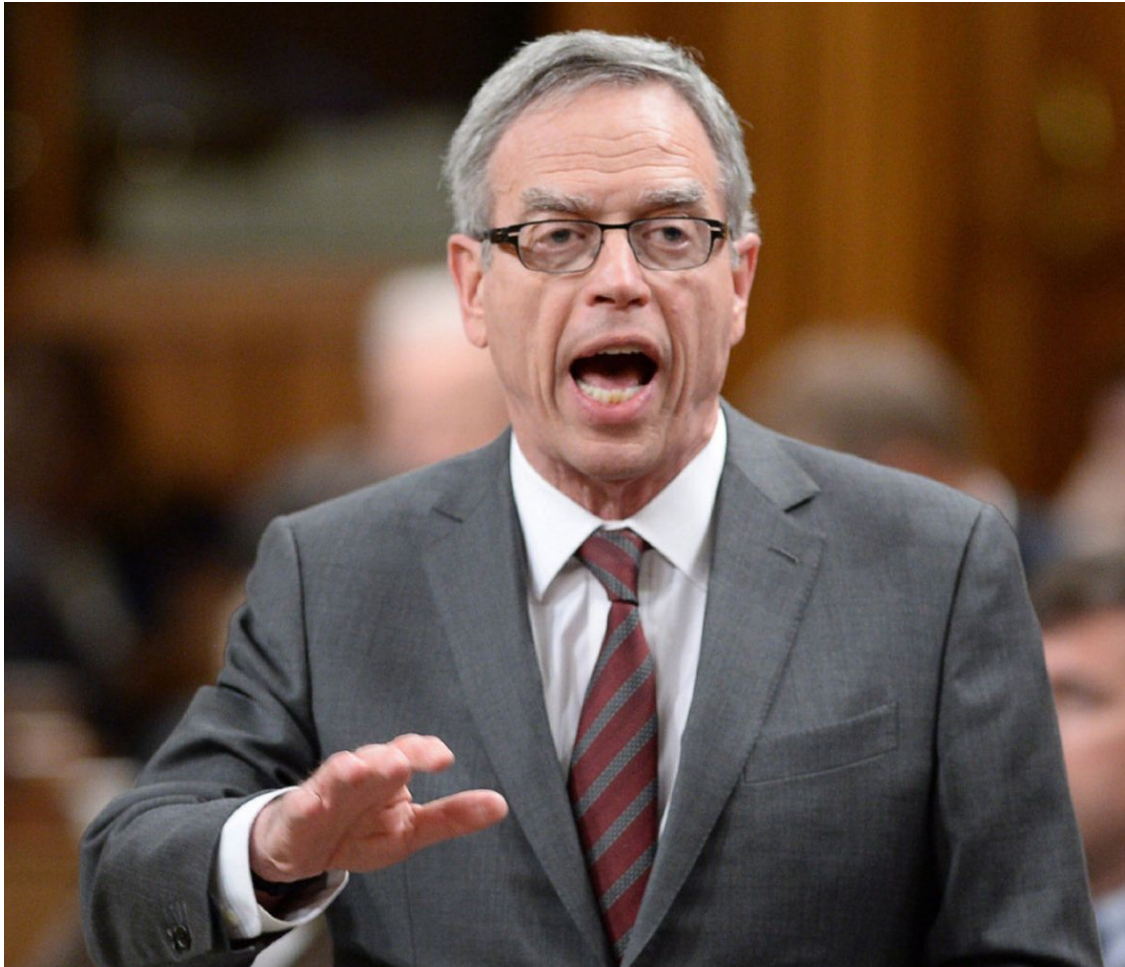
Joe Oliver, Chair, Independent Electricity System Operator (IESO)